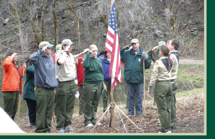
The Primary Purpose of the Wood Badge experience is to strengthen Scouting in our units, districts, and council. Every boy deserves a well-trained leader